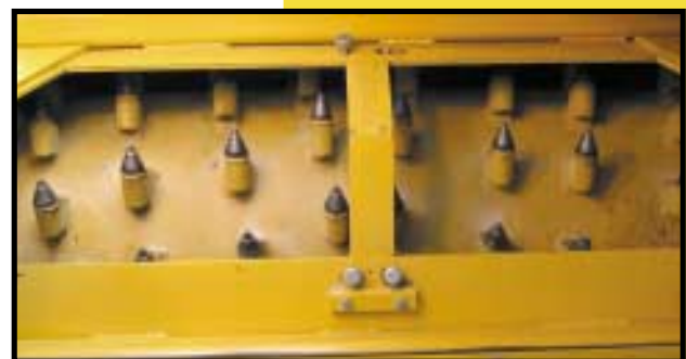
Standard drum, .76" shank bit on 1/2" lateral spacing